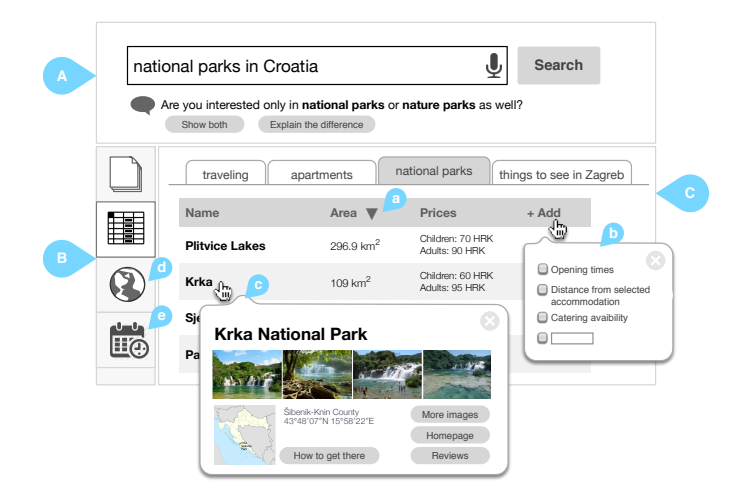
Figure 1: Excerpt from the envisaged user interface.

Finally, when all this information has been collected, the family might ask the question before deciding: What if we go a week later?