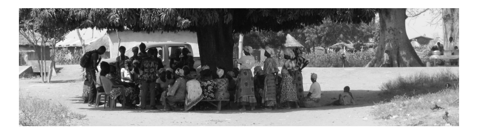
Fig. 1. A typical requirements analysis workshop with farmers in Guabuliga village, northern Ghana, December 2014

Case: Context analysis in Ranawa, Burkina Faso A context analysis was done e.g. in 2009 in Ranawa, a rural community of 2300 inhabitants, in the Central Plateau of Burkina Faso. This rural village is representative for a lowresource, low-tech community. People live from subsistence farming and produce millet, sorghum, sesame and have some livestock.