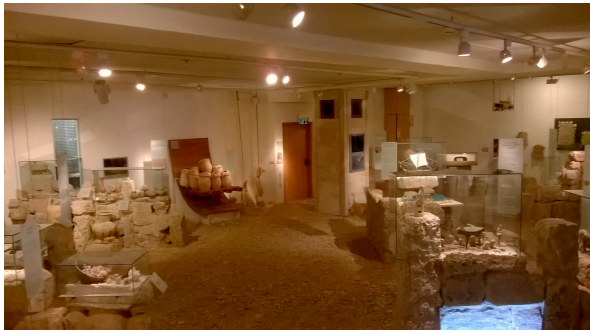
Figure 9. A challenging exhibition: harsh light conditions and low-height.