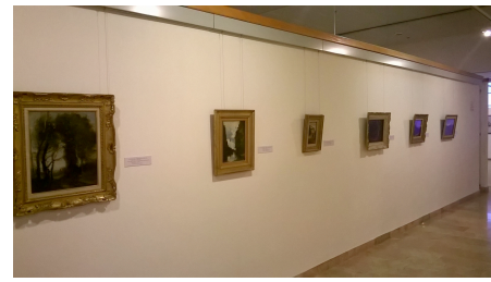
Figure 4. Gallery exhibition