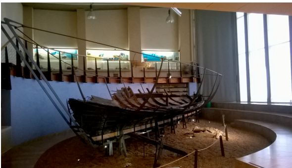
Figure 10. A challenging exhibit: too big to fit in one frame.