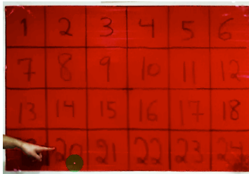
Figure 2. User study 1. The finger points at the grid where the participant were asked to look at. The green circle is a fixation point given from the eye tracker. The size of each cell is 20x20 cm.

Five students from the University of Haifa, without any visual disabilities participated in this study. They were asked to look at wall-mounted grid from a distance of 2 meters and track a finger (see figure 2). On every cell that the finger pointed at, they were asked to look at for approximately 3 seconds. Data was collected for determining the practical measurement accuracy. The results were as follows: on average, fixation detection rate was ~80% (most missed fixations were in the edges/corners – see table 1 for details about misses). In addition, average fixation point error rate, in terms of distance from the center of grids, was approximately 5 cm (exact error rate can be calculated using simple image processing techniques for detecting the green circle and applying mapping transform to the real word).