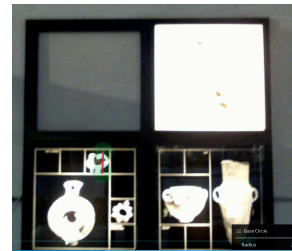
Figure 5. Mounted backlit images exhibition

In this study we examined the accuracy of the eye tracker in a realistic setting. One participant (1.79m tall) was asked to look at exhibits at the Hecht museum. Several exhibits were chosen with different factors and constraints (see figure 4, 5, and 6). The main constraint in this case is the distance from the exhibit since the visual range gets larger when the distance grows, and mainly we have to cover all the objects that we are interested in. Table 2 presents the objects height from the floor and the distance of the participant from the object. The next step was to examine fixations accuracy after making sure that the participant is standing in a proper distance. The participant was asked to look at different points in the exhibit/scene. In the gallery exhibits, the scan path has been set to be the four corners of the picture and finally the center of it. Regarding the vitrine exhibits, for each jug one point at the center has been defined