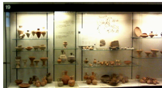
Figure 6. Vitrine backlit exhibition.

It's important to note that the heights/distances relation is for visual range (having the objects in the frame of the camera) and not for fixations detections. Since missed fixations could be as a result of a set of constraints and not the distance from the object, thing that we have not examined yet.