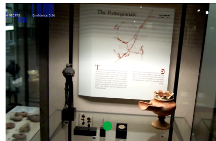
Figure 7. Example of eye-tracker scene camera. The green point is the fixation point.