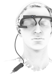
Figure 1. Pupil eye-tracker ( http://pupil-labs.com/pupil )

Pupil eye tracker [Kassner et al. 2014] is an open source platform for pervasive eye tracking and gaze-based interaction. It comprises a light-weight eye tracking headset that includes high-resolution scene and eye cameras, an open source software framework for mobile eye tracking, as well as a graphical user interface to playback and visualize video and gaze data. The software and GUI are platform-independent and include algorithms for real-time pupil detection and tracking, calibration, and accurate gaze estimation. Results of a performance evaluation show that Pupil can provide an average gaze estimation accuracy of 0.6 degree of visual angle (0.08 degree precision) with a processing pipeline latency of only 0.045 seconds.