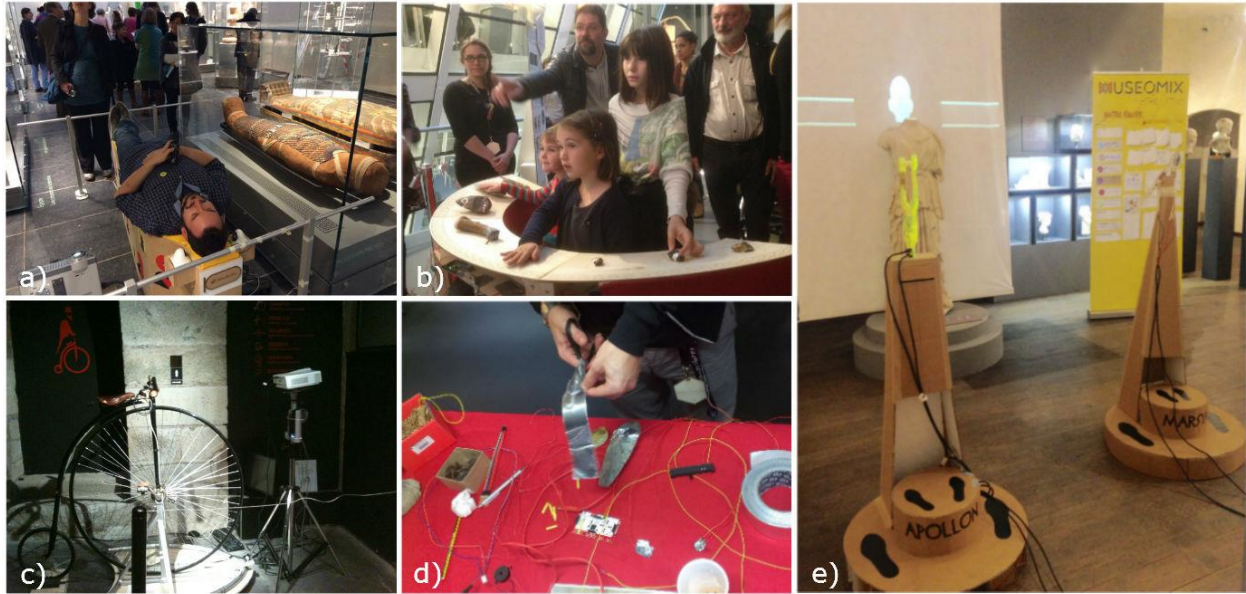
Figure 2: Museomix prototypes a) Momix b) Prehistopiano c) Museocyclette d) Making-off Prehistopiano e) Hero des Lyres