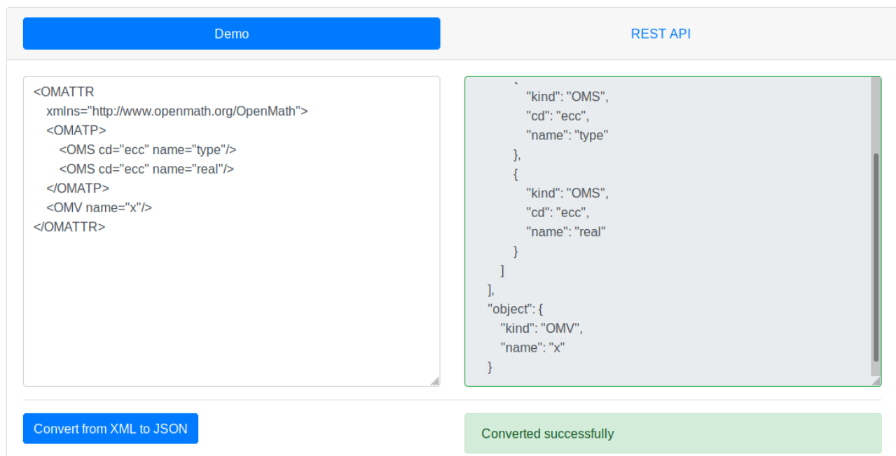
Figure 2: Interface for converting OpenMath XML to JSON.