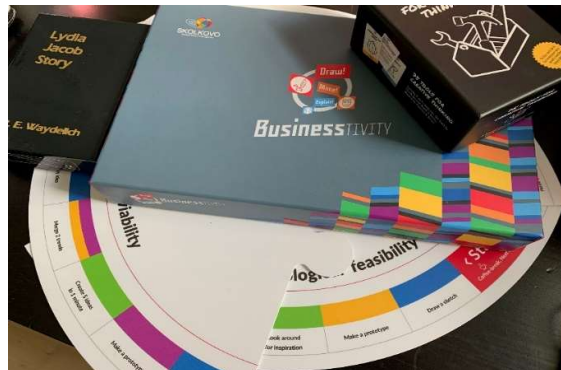
Fig 3. Business storyboard cards and games.

Harmonization of current game-oriented software-based approaches for a better understanding of business processes [16] and physical card/storyboards such as SAP Scenes method can be a very effective way of bringing management education in Innovations to the new level. We use a hybrid approach specifically for MBA, EMBA, and MSc in Information Systems students they are very much capable of dealing with mobile apps as part of day to day business, and physical cards are a great tool to create a tangible experience. In fact, tangible experience is an essential ingredient for successful Design thinking management education. Below, some examples of storyboards cards and games (Fig 3).