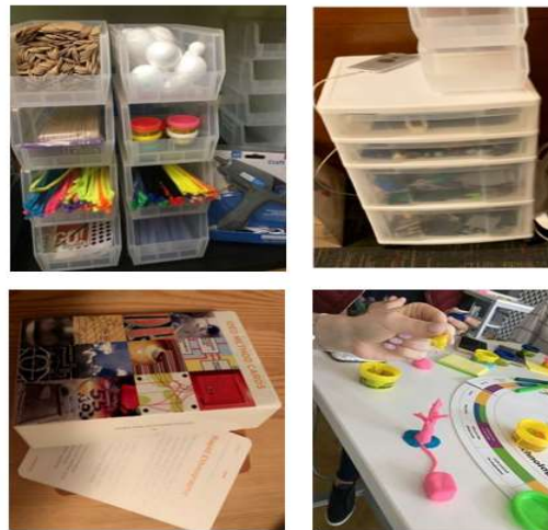
Fig.4. Prototyping tools

Prototyping tools examples are presented below.