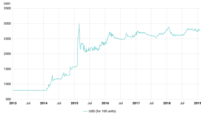
Fig. 2. UAH / USD exchange rate in 2013-2019

Thus, we can calculate indicators: r = -0.2350 . As we see, there is a very weak link between the indicators. And we will get resulting model with main parametric variable a_0 = 2636.5 , a_1 = -37.907 :