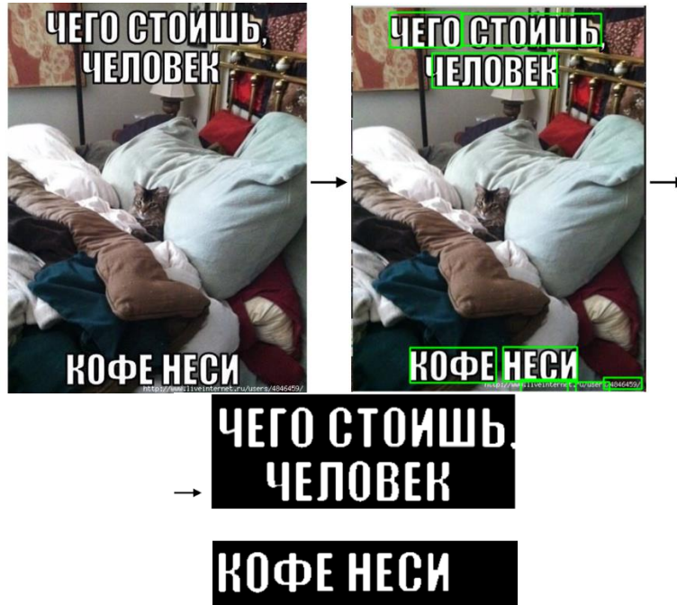
Fig. 3. Algorithm basic steps for text detection.

if len(textblocks) > n then txt = Tesseract(textblocks); else txt = TEXTEXTRACTOR(textblocks); show txt;