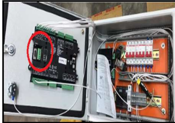
Figure 2: Image of the equipment with its DB-9 connector

specifications of the equipment, the communication module allows the export of information based on the behavior of the equipment with two indicators of consumption, first we have the output voltage and current consumption, these two values can be obtained by reading from the DB-9 connector.