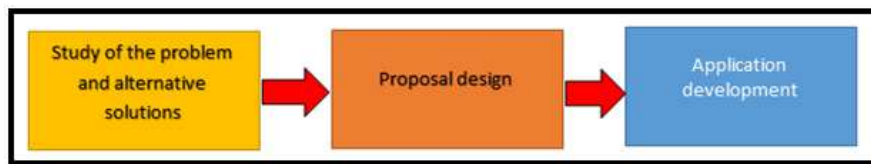
Figure 1: Block diagram of the proposed methodology.

In order to develop the methodology, the following three stages were designed, which are presented in figure 1, where each of the stages corresponds to an essential process in the fulfillment of the objective, the results of each stage serve as input for the next stage, that is It is necessary to have the necessary equipment and the necessary wireless connection, in order to demonstrate the use and application of the methodology. Each of the stages is developed below, describing the elements necessary for its application, as well as the application and the results we hope to obtain.