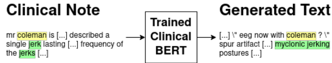
Figure 1: A few examples from a clinical note that the model seems to have memorized. The name (i.e. "Coleman") and the condition (e.g. "myclonic jerking") are highlighted in yellow and green respectively.