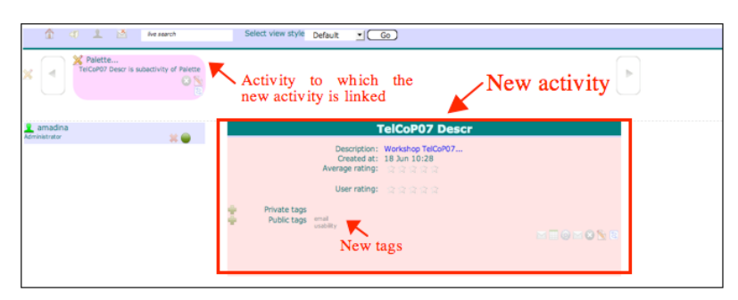
Fig. 6. Context view for the new activity "TelCoP07".