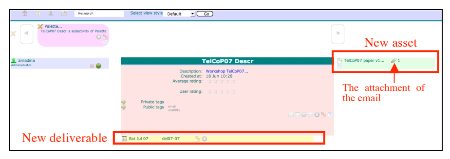
Fig. 9. Context view of the activity "TelCoP07". A new deliverable is created.