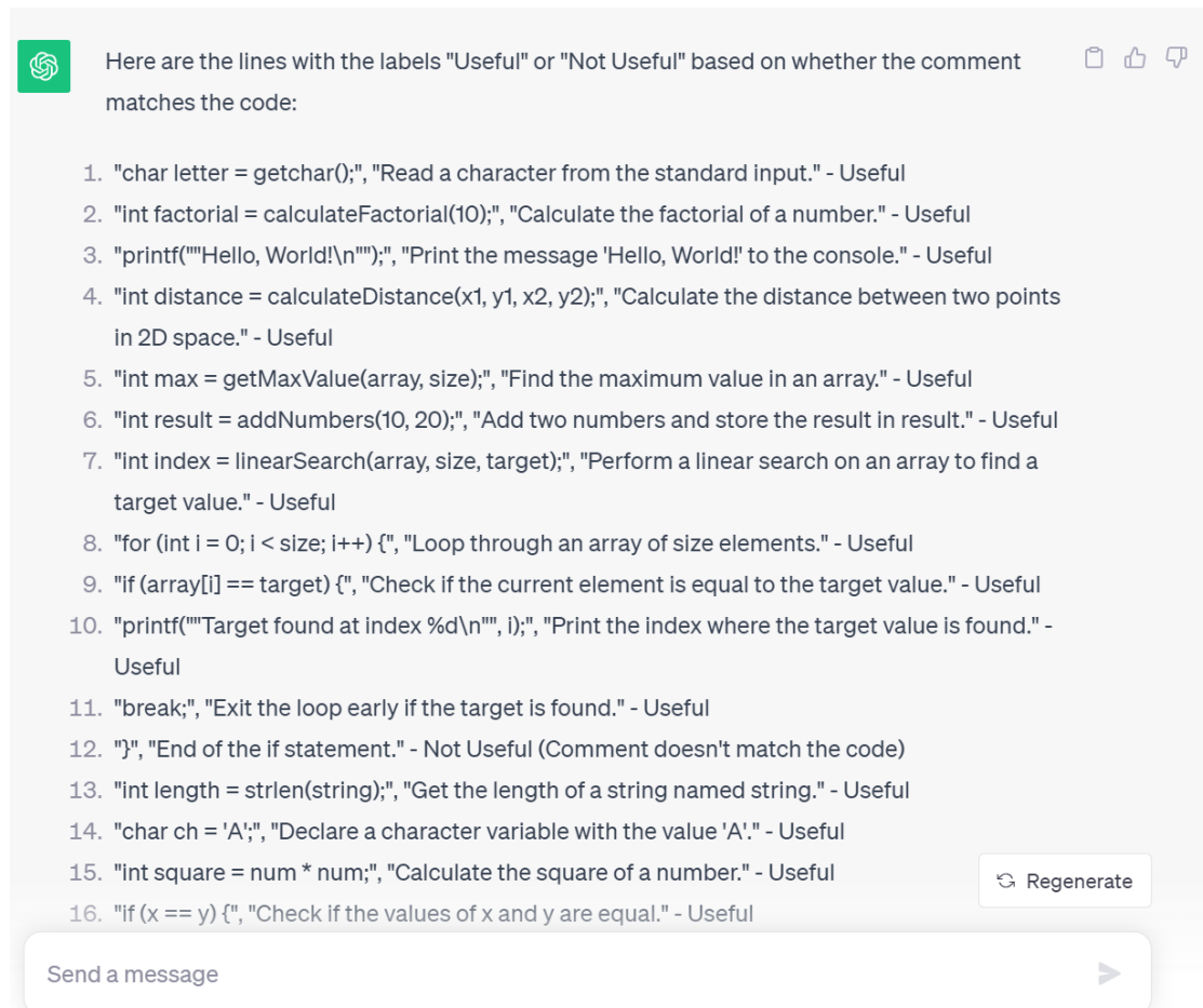
Figure 2: Example of ChatGPT Ggenerated Data

The Voting Classifier is based on 3 estimator models: a Random Forest, a Neural Network and a Linear SVC. The Random Forest has the following parameters: number of estimators = 100, criterion = gini, minimum samples split = 2, minimum samples leaf = 1, maximum features = sqrt, bootstrap = True. The Neural Network has the following configuration: number of hidden layers = 2, hidden layers sizes = (20,10), activation = relu, solver = adam, alpha = 0.0001, learning rate = constant, initial learning rate = 0.001, maximum iterations = 200, shuffle = True, tolerance = 0.0001, momentum = 0.9, nesterov's momentum = True, beta 1 = 0.9, beta 2 = 0.999, epsilon = 0.00000001. The Linear SVC is configured as follows: penalty = L2, loss = squared hinge, dual = True, tolerance = 0.0001, C = 1.0, fit intercept = True, maximum iterations = 1000. The voting strategy is set to hard.