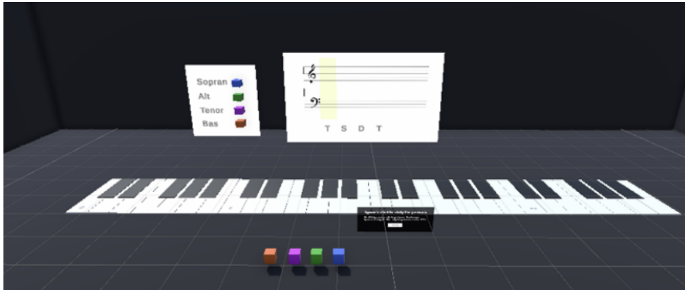
Figure 1: HarmosphereVR - scene before exercise.

methodologies in music education. There exists a strong inclination to persist in the use of these innovative tools to enhance the quality of learning experiences [3]. The application of technology in supporting classroom instruction and its integration into students' independent study facilitates essential music discussions outside of traditional settings and contributes to creating a more captivating learning atmosphere [4].