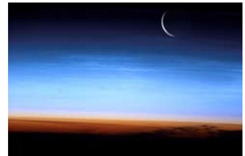
NASA Photo ISS007-E-10974

The clouds are made of tiny ice crystals. Sunlight scattered by the crystals give the clouds their blue color.