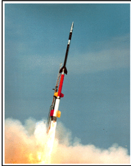
Figure F.7-1: Black Brant XII Launch Vehicle

The Black Brant XII rocket system (Figure F.7-1) is a four stage system used primarily to carry a variety of payloads to high altitudes. Its development is a spin-off of the Black Brant X development.