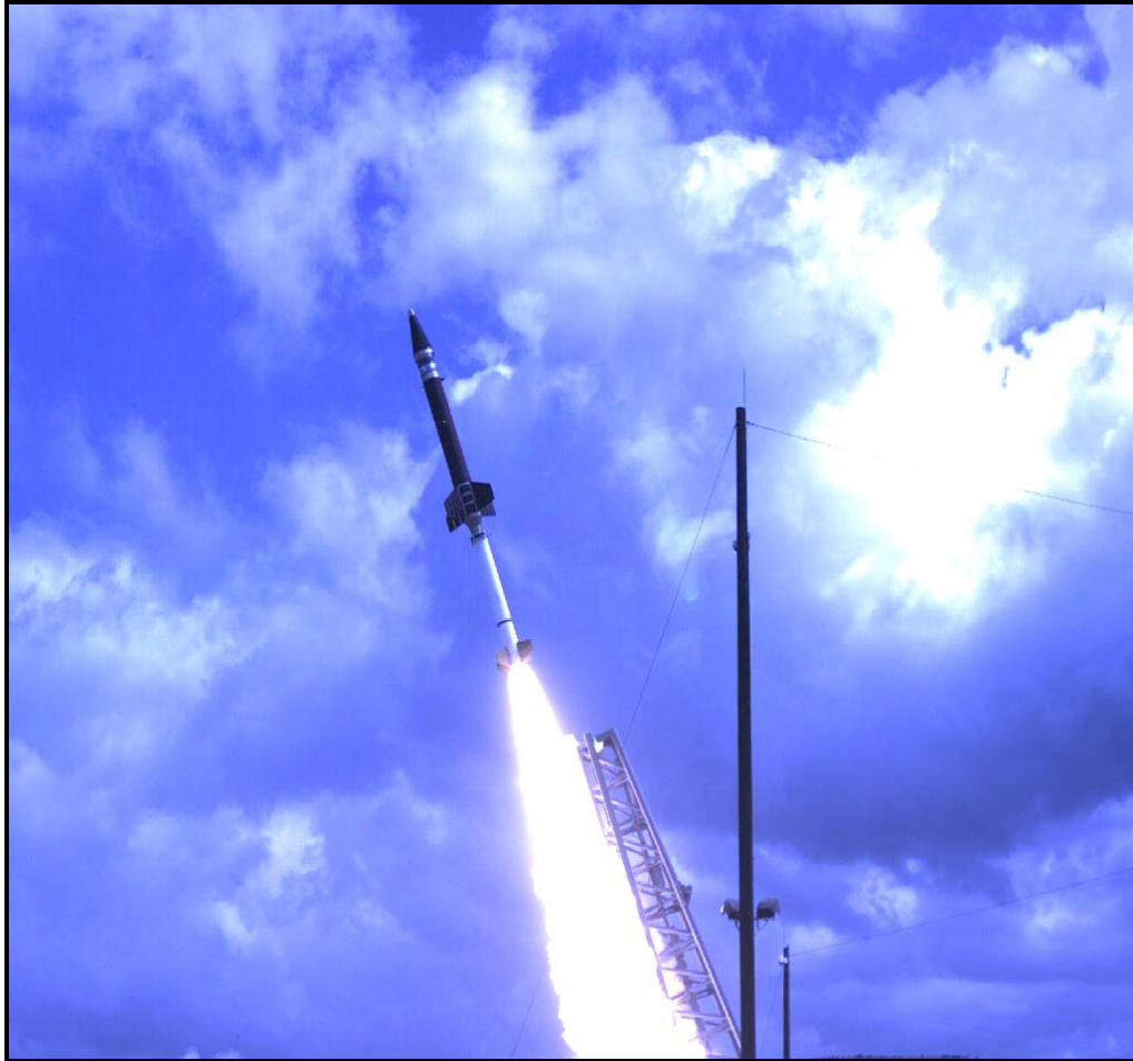
Figure F.10-1: Terrier Oriole

The Terrier Oriole is a two-stage, unguided, fin stabilized rocket system which utilizes a Terrier first stage booster and an Oriole rocket motor for the second stage propulsion. The Terrier motor has four equally spaced fins, and the Oriole motor has four fins on the aft end arranged in a cruciform configuration to provide stability.