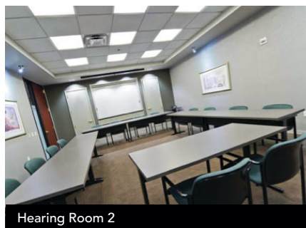
Hearing Room 2