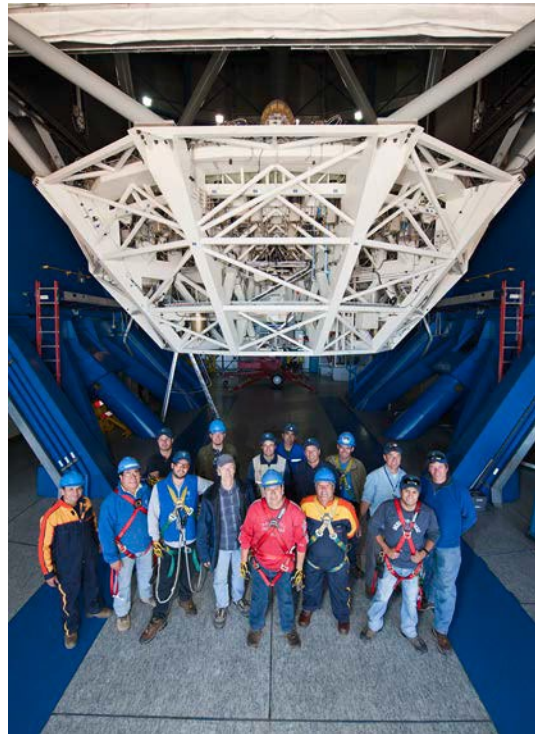
Group shot of engineers and maintenance staff at the VLTI.

LSM appointed as an Emergency Coordinator at the observatories in the absence of the safety engineer during weekends or leave, are compensated under the same conditions as standby duty.