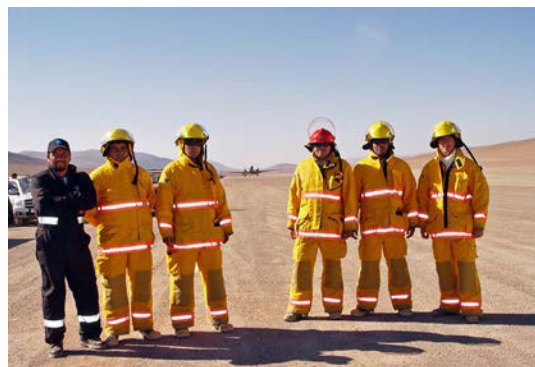
The Paranal Fire Brigade.