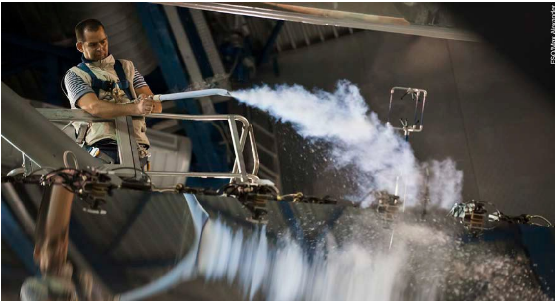
Cleaning mirrors with CO 2 .

Telescope and Instruments Operators (TIO) working full in night shifts 7/7 receive an additional payment of 35% of the basic salary. The Local members of the personnel assigned partially receive the equivalent pro-rata proportion depending on the number of nights being performed.