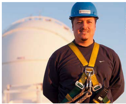
Electronic technician working on UTH/AOF.

LSM assigned to an observatory shall receive adequate working clothes and shoes, as recommended by the safety commission.