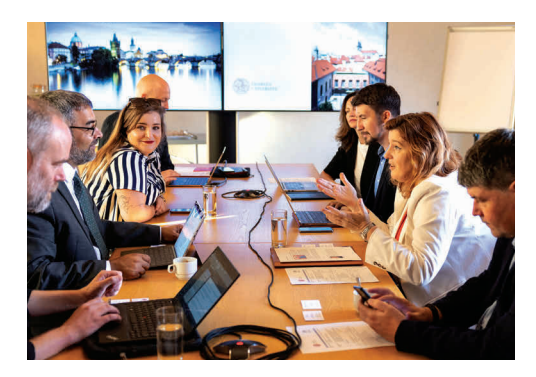
Sussex's Global Engagement team meeting with one of Sussex's EPDF partners, Charles University, in Prague

In response to the UK's changing relationship with the European Union, Sussex has initiated the Sussex European Partnership Development Fellowships (EPDF) to further our collaborations with leading European partners and help us work in partnership towards our Sussex