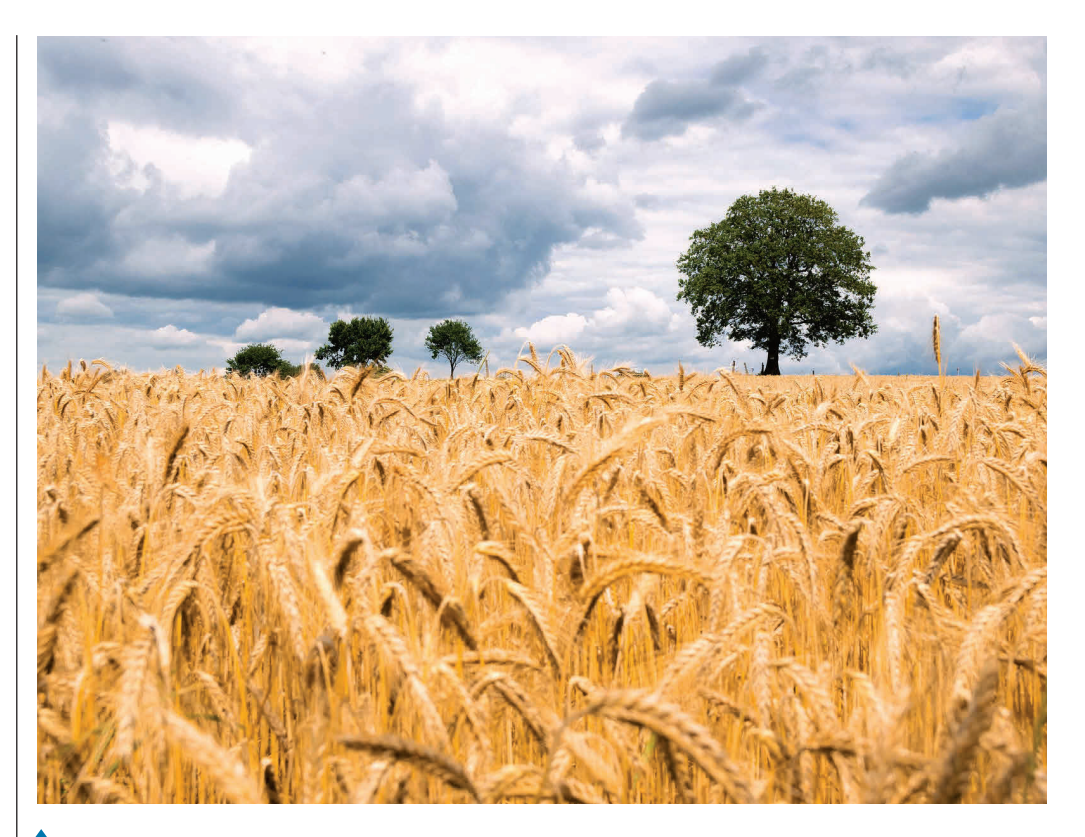
Wheat crops can now be better protected, thanks to the work of Sussex and Ukranian researchers

The hope is that this free training will help the Ukrainian people by upskilling their Government communicators in a way that could ultimately be used at a national level.