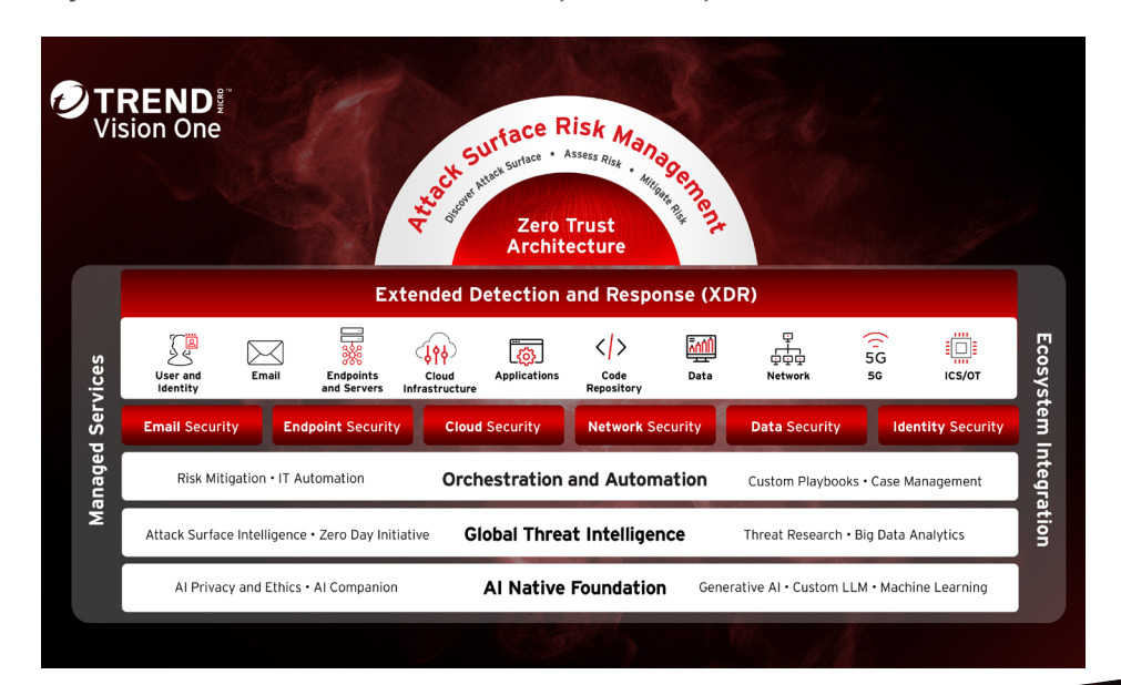
Figure one: overview of Trend Vision One platform capabilities and unified solutions

Anticipate your adversaries and develop more proactive and resilient programs by providing in-depth coverage across the attack surface risk management lifecycle. Trend Vision One identifies internal and internet-facing assets, assesses individual assets and company-wide risk, and provides custom, intelligent remediation recommendations while addressing your detection and response needs concurrently.