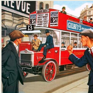
Above: 1926 General Strike Breakers

Effectively, the entire period between the wars was a time of economic depression that became exceptionally severe after the US Wall Street crash in 1929. Earlier, in 1926, this created the situation of the British 1926 general strike. It was the support of Walthamstow people for the strikers that caused a vindictive British government to delay agreement of Walthamstow's application to become a Borough until 1929.