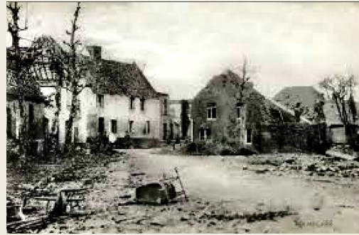
Festubert Village in WWI