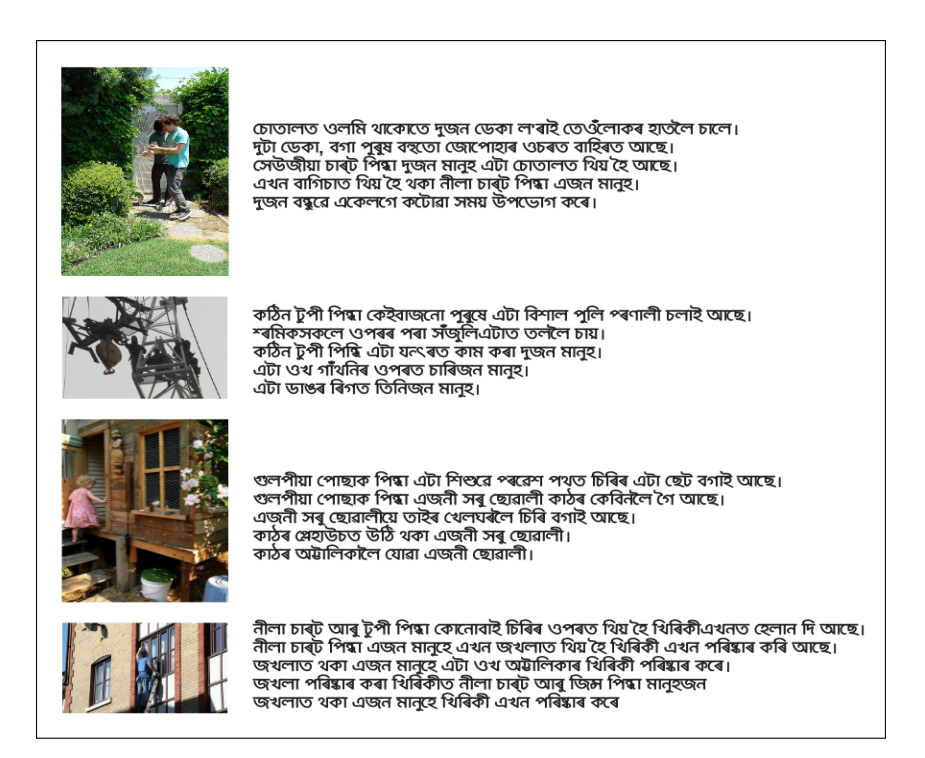
Figure 2: Overview of the source data

many layers have performed well in pattern recognition. Apart from this, these models are also suffer from the overfitting and difficult to optimise. Residual CNNs are comprised of many layers with interconnections between them. Identity mapping is decided to carry out by these connections. VGG16 has 16 layers and is simpler than EfficientNetB3. Efficient-NetB3 are simple to optimise, and their performance improves as network depth increases. We used only the encoded image features produced by the hidden layers and discarded the pretrained models' final output layer because it contains the final output of classification.