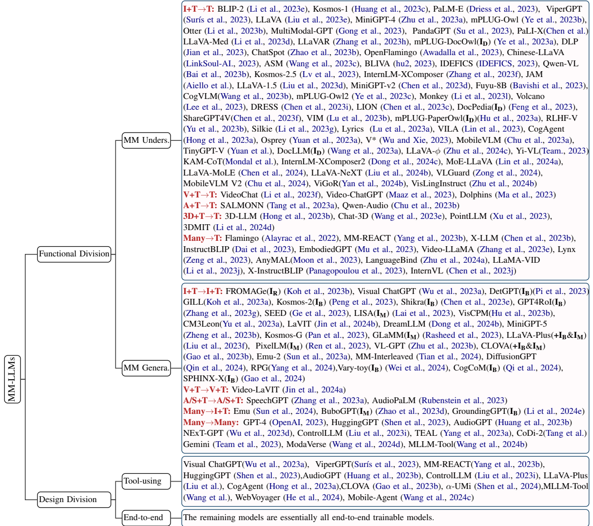
Figure 3: Taxonomy for MM-LLMs. I: Image, V: Video, A/S: Audio/Speech, and T: Text. I B : Document understanding, I B : Output bounding box, I M : Output segmentation mask, and I R : Output retrieved images.

MM IT comprises Supervised Fine-Tuning (SFT) and Reinforcement Learning from Human Feedback (RLHF), aiming to align with human intents and enhance the interaction capabilities of MM-LLMs. SFT converts part of the PT stage data into an instruction-aware format. Using visual Question-Answer (QA) as an example, various templates may be employed like (1) “<Image>{Question}” A short answer to the question is; (2) “<Image>” Examine the image and respond to the following question with a brief answer: “{Question}. Answer:”; and so on. Next, it fine-tunes pre-trained MM-LLMs using the same optimization objectives. SFT datasets can be structured as either single-turn QA or multi-turn dialogues.