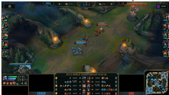
Screenshot of “ITEM_PURCHASED” event (for explanation):