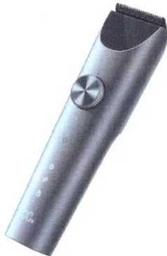
Imagen en color del producto: