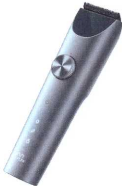
Immagine a colori del prodotto: