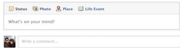
Figure 1. Screenshot of the “composer” (top) and comment box (bottom) HTML elements on Facebook.

To measure censorship, we instrumented two user interface elements of the Facebook website, shown in Figure 1: the “composer”—the HTML form element through which users can post standalone content such as status updates—and the “comment box”—the element through which users can respond to existing content such as status updates and photos. To mitigate noise in our data, content was tracked only if at least five characters were entered into the composer or comment box. Content was then marked as “censored” if it was not shared within the subsequent ten minutes; using this threshold allowed us to record only the presence or absence of text entered, not the keystrokes or content. If content entered were to go unposted for ten minutes and then be posted, we argue that it was indeed censored (albeit temporarily). These analyses were con-