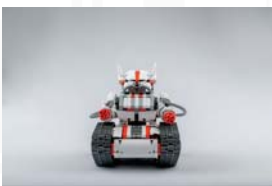
Imagen en color del producto: