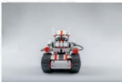
Immagine a colori del prodotto: