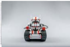
Imagem a cores do produto: