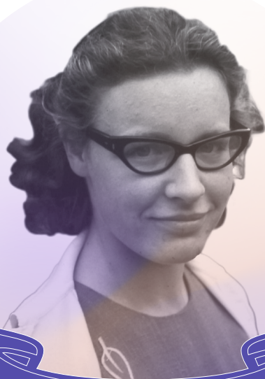
Jocelyn Bell Burnell