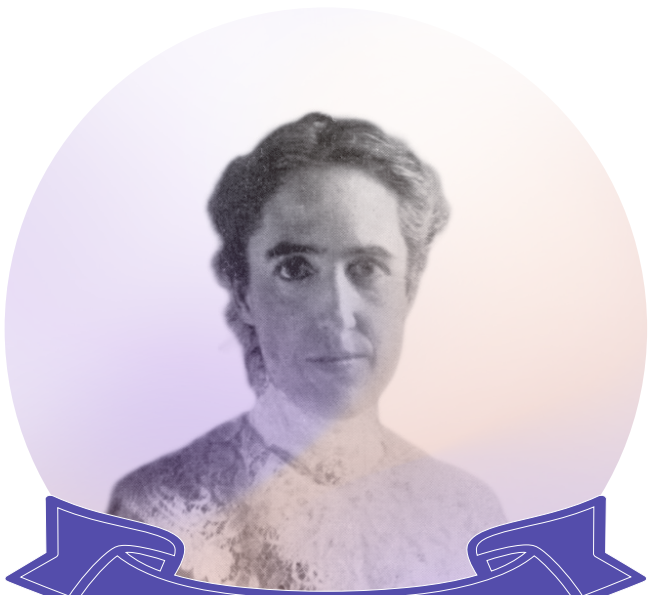
Henrietta Swan Leavitt