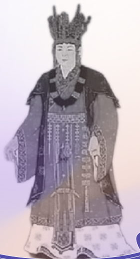
Queen Seondeok of Silla