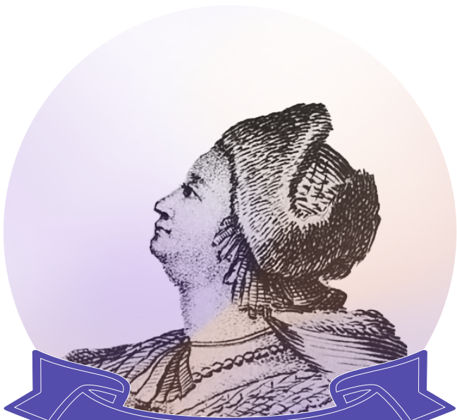
Elżbieta Koopman Heweliusz