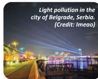
Light pollution in the city of Belgrade, Serbia.

Mangrove finch.