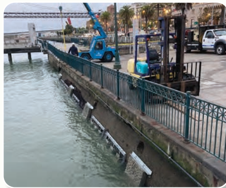
Tile frames installed by the Port of San Francisco at the site where researchers will begin to monitor marine community development.

Eco-engineering the Bay shoreline combines the need for safety with the possibility of a better ecosystem for wildlife.