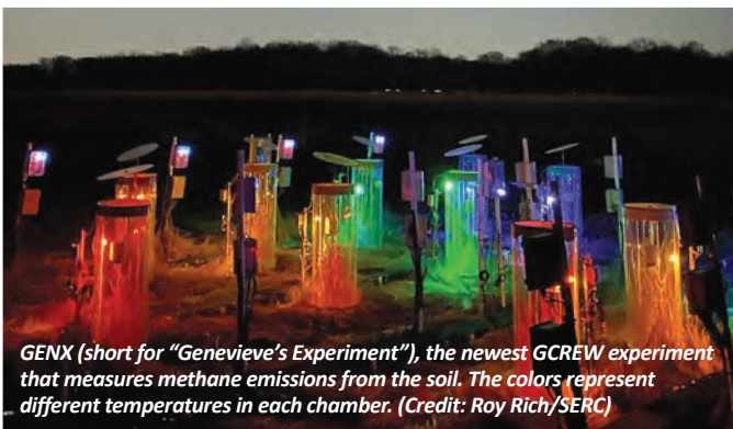
GENX (short for "Genevieve's Experiment"), the newest GCREW experiment that measures methane emissions from the soil. The colors represent different temperatures in each chamber.