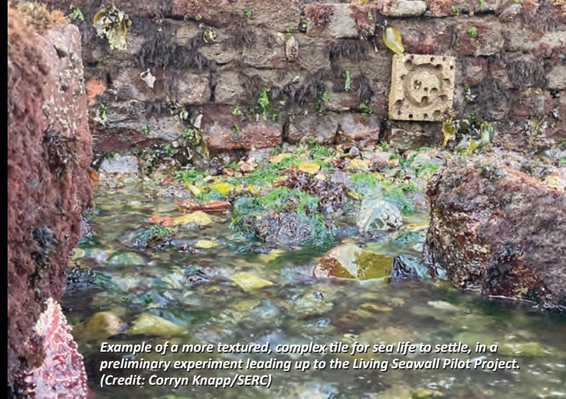
Example of a more textured, complex tile for sea life to settle, in a preliminary experiment leading up to the Living Seawall Pilot Project.

A longer version of this article originally appeared in ECO Magazine, for their special November issue on Marine Invasions.