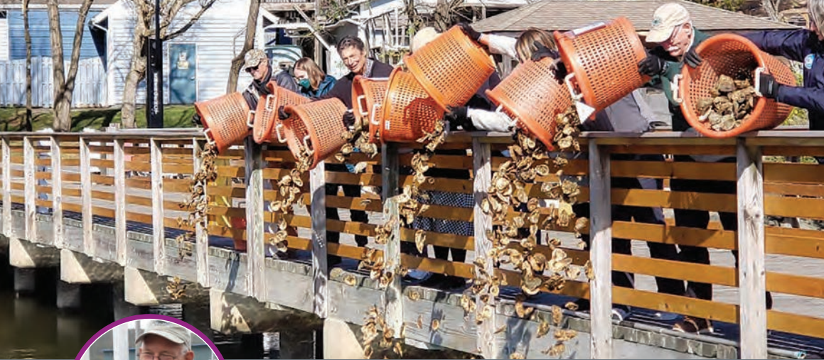
Staff from SERC and the Chesapeake Bay Foundation dump oysters off the SERC docks, to add to SERC's restoration reef in the Rhode River.