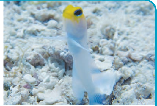
Yellowhead jawfish (Opistognathus aurifrons), a fish that needs sand habitat to burrow.

In a five-year study, divers from the Smithsonian's MarineGEO network surveyed four habitats in Belize's Carrie Bow Cay: corals, mangroves, seagrasses and sand. Despite having fewer fish species overall, sand flats hosted the highest percentage of unique species—making them irreplaceable components of underwater biodiversity.