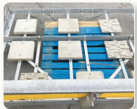
Three different tile types in the project: smooth normal concrete, smooth bio-enhanced concrete and textured bio-enhanced concrete.

The Port of San Francisco's seawall reconstruction is a vital project that ensures the safety of San Francisco's residents. With this collaboration, we can make the most of an important project. Here's to thinking of not only our own safety, but the safety of the creatures in the bay too.