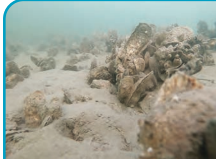
Oysters in Harris Creek, home to a restored reef scientists analyzed as part of the study.