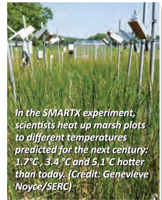
In the SMARTX experiment, scientists heat up marsh plots to different temperatures predicted for the next century: 1.7°C, 3.4 °C and 5.1°C hotter than today.

I've been at SERC for almost six and a half years at this point, so [I am excited about] the fact that I can stay at SERC and keep building on all this research and the collaboration that I've made over the past six years. It's nice to know these experiments like SMARTX that I've been working on, or GENX that I've started, can keep going because I'm still going to be here and be able to run them.