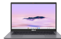
ASUS Chromebook Plus CX34