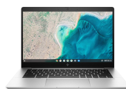
HP Elite c640 G3 Chromebook