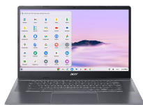
Acer Chromebook Plus 515