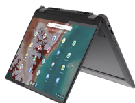
Lenovo Flex 5i Chromebook

Unlock all the built-in capabilities of ChromeOS for your business, with ChromeOS Enterprise devices or purchase ChromeOS device management and attach it to your existing devices.