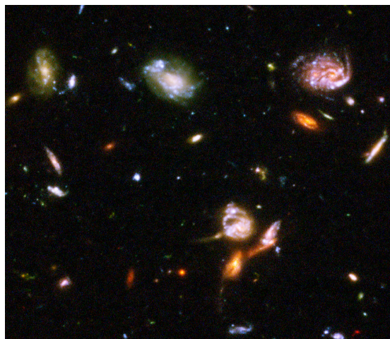
The Hubble Ultra Deep Field (left; expanded to the right) was taken by ACS, whose detectors are sensitive to visible, infrared, and ultraviolet light.