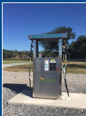
CNG pump at the St. Landry site 8