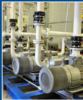
RNG production facility at the SWACO landfill 7