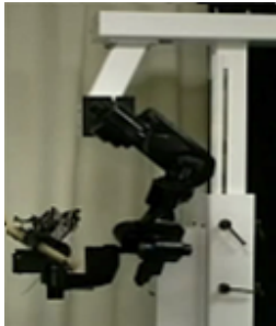
Fig. 1: Anthropomorphic SARCOS master robot arm.

it is time that we reevaluate this issue using state-of-the-art methods. In this paper, we compare three different nonparametric regression methods for learning the dynamics model, i.e., the locally weighted projection regression (LWPR) [5], the full Gaussian processes regression (GPR) [6] and the \nu -support vector regression ( \nu -SVR) [7]. The approximation quality is evaluated using (i) simulation data and (ii) real data taken from a 7 degree-of-freedom (DoF) SARCOS master robot arm, as shown in Figure 1. Furthermore, we will examine the tracking performances of the robot using the learned models in the setting of feedforward nonlinear control [1].