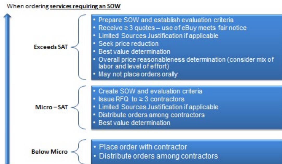
Figure 2: HACS Ordering Process related to the SAT

(See also GSA Quick Reference MAS Ordering Guide )