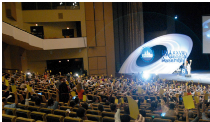
Voting on Resolution 5A, “Definition of ‘planet’”, at the 2006 Prague General Assembly.

The IAU gradually had to devote more energy to its task of defending the interests of astronomy, especially against light and space pollution and against the fraudulent “selling” of names of astronomical objects. Since the 1990s, the IAU has also assumed a more prominent role in efforts to raise awareness of the need for global monitoring of potentially dangerous Near Earth Objects and consideration of mitigating actions.