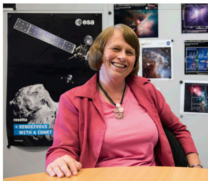
Ewine van Dishoeck about her first General Assembly: “Many legends were there — for example, I remember seeing Chandrasekhar.”

Even though the number of scientific meetings has increased dramatically since then, the General Assemblies have remained central to the astronomical community.