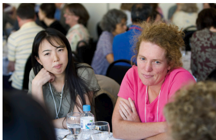
The Women in Astronomy Lunch has become a regular feature of the IAU General Assemblies.

graphical diversity was demonstrated, for example, by General Assemblies in Argentina and India.