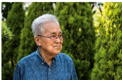
Yoshihide Kozai: "The General Assembly [in Kyoto] was important for the East Asian region as a whole, attracting many young scientists from China, Korea, and other Asian countries."

then, and new countries have gradually become more prominent in astronomy; Spain, China and post-Apartheid South Africa are impressive examples.