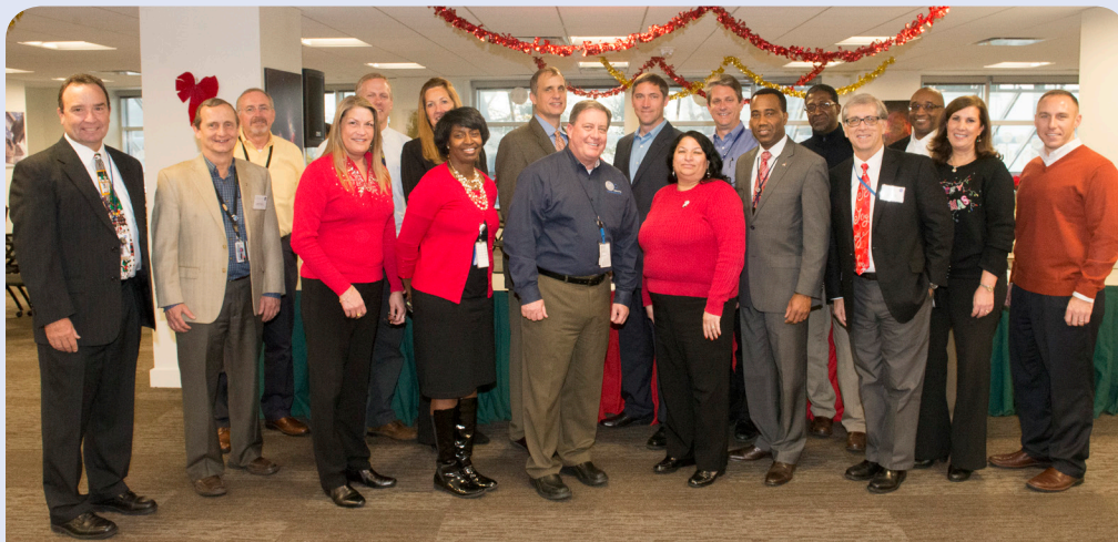
The CIO's attended a face-to-face meeting at NASA Headquarters from December 16-18, 2014.

National Aeronautics and Space Administration