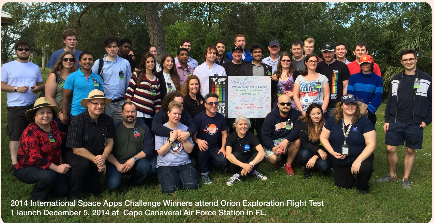
2014 International Space Apps Challenge Winners attend Orion Exploration Flight Test 1 launch December 5, 2014 at Cape Canaveral Air Force Station in FL.

For additional information and points of contact, see the JSC/CSSO Collaborative Cloud Testing Report at https://sp.ksc.nasa.gov/sites/adcc/Pages/CCCOIpres.aspx . ♦