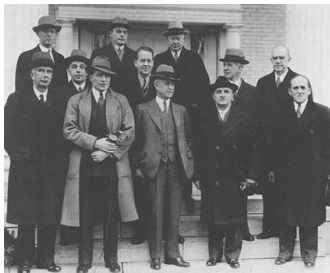
Dec. 1936 NACA meeting at the home of Orville Wright (Orville in the front row, center).

Twelve years following the Wright Brothers' first flight, the National Advisory Committee on Aeronautics (NACA) was born to advance aeronautics research. Four decades later, NACA became NASA to include space research along with aeronautics. NASA aeronautics research has helped flight continue to grow and evolve towards a more sustainable future. With the help of a diverse workforce of brilliant minds, NASA has made many contributions to aviation and air traffic management .