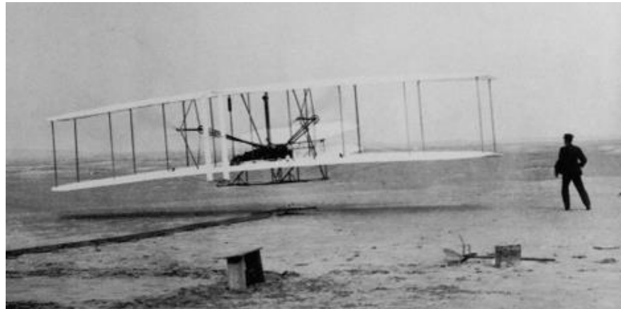
On December 17, 1903, two brothers from Dayton, OH--Wilbur and Orville Wright successfully flew a powered aircraft above the sand dunes of Kitty Hawk, NC.