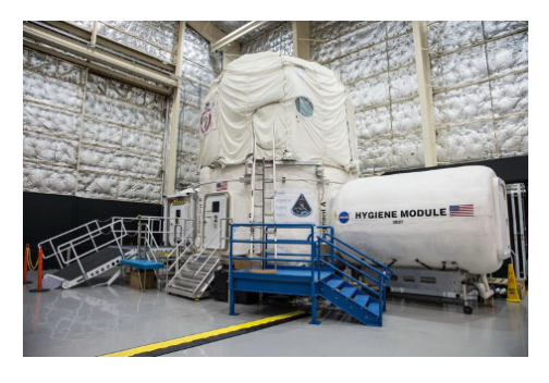
NASA's HERA habitat at Johnson Space Center