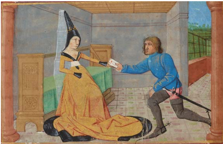
Geneviève Receiving King Mark’s Letter , by the Master of the Vienna Mamerot. Romance of Tristan ; France, Bourges?, dated 1468. Pierpont Morgan Library, MS M.41, f. 24v (detail). From section 6: “Late Gothic Vertigo, 1460s and ’70s”