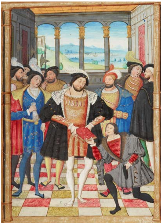
François I Receiving the Volume, by the Master of Girard Acarie. Romance of the Rose ; France, Rouen, ca. 1525. Pierpont Morgan Library, MS M.948, f. 4 (detail). From section 8: “Dawn of the Renaissance, 1515 and Beyond”