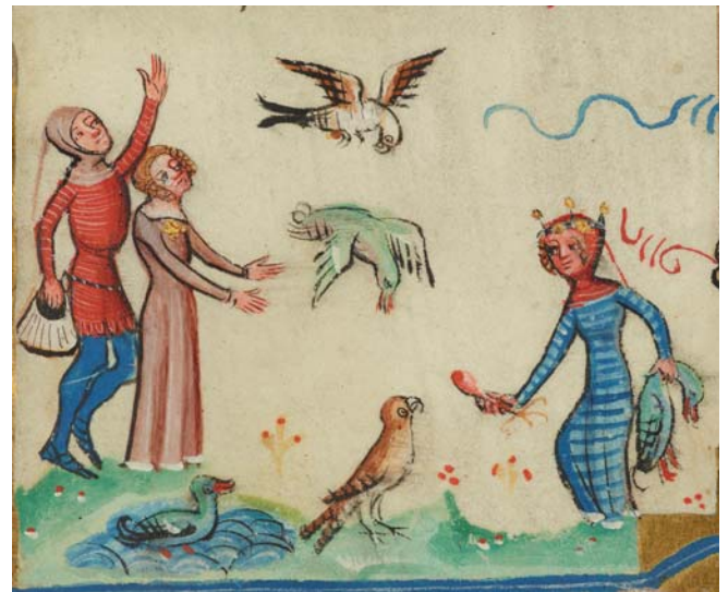
Youth and Two Maidens Hawking. Wusthorpe Missal; Germany, Hamburg, shortly before 1381. Pierpont Morgan Library, MS M.892.3 (detail). From section 2: "Wasp Waists and Stuffed Shirts, 1350-90"