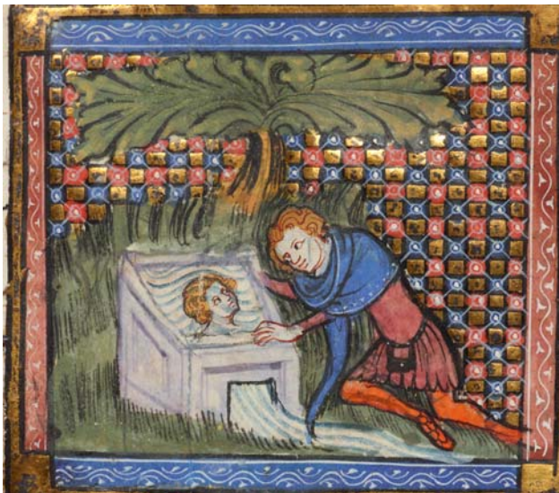
Narcissus Admires Himself. Guillaume de Lorris and Jean de Meun, Romance of the Rose ; France, Paris, ca. 1340-50. Pierpont Morgan Library, MS M.48, f. 12v (detail). From section 1: "Fashion Revolution, 1330-50"