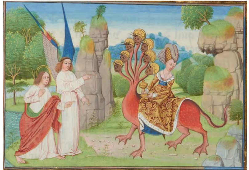
The Whore of Babylon Dresses the Part , by Loyset Liédet and his workshop. Epistolary and Apocalypse of Charles the Bold; Belgium, Bruges, ca. 1470. Pierpont Morgan Library, MS M.68, f. 217r (detail). From section 5: “Peacocks of the Mid-Century, 1430-60”