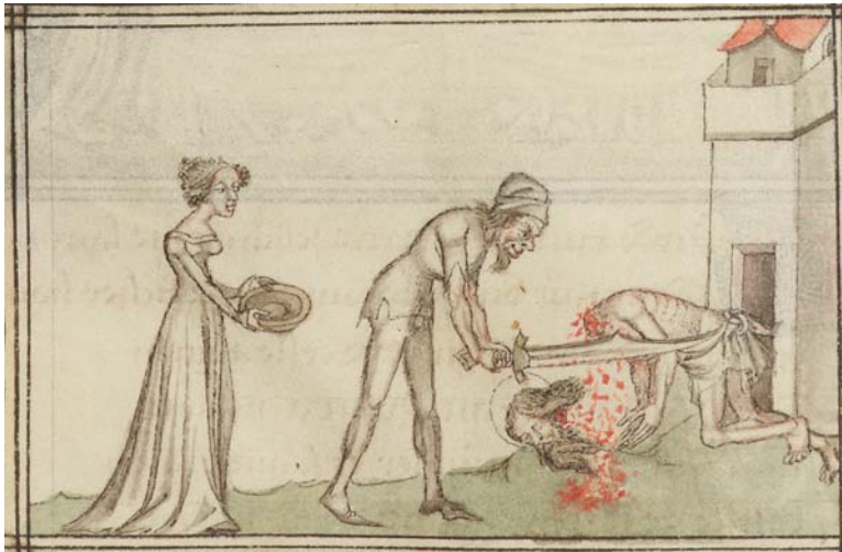
Salome in Killer Clothes , by the Master of Death. History of the Bible and of the Assumption of Our Lady ; France, Paris, 1390s. Pierpont Morgan Library, MS M.526, f. 33v (detail). From section 2: “Wasp Waists and Stuffed Shirts, 1350-90”