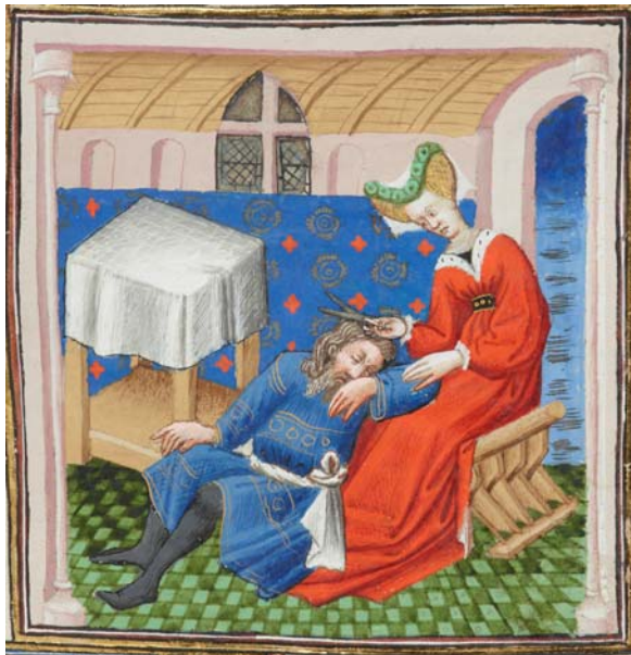
Delilah Shearing Samson’s Hair , by the workshop of the Boucicaut Master. Bible historiale ; France, Paris, ca. 1415-20. Pierpont Morgan Library, MS M.394, f. 112 (detail). From section 3: “Luxury in a Time of Madness, 1390-1420”