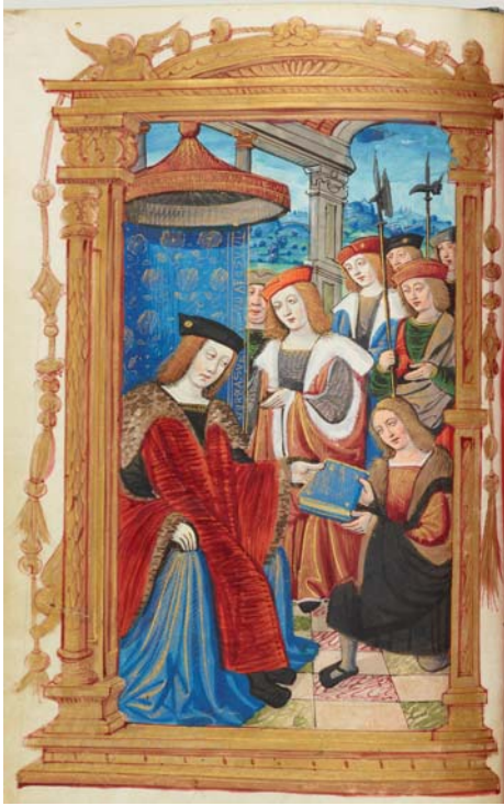
Bulkiness Dominates the Look for Men. Pierre Gringore, Abuses of the World ; France, Rouen, ca. 1510. Pierpont Morgan Library, MS M.42, f. 1v. From section 7: “Twilight of the Middle Ages, 1480-1515”