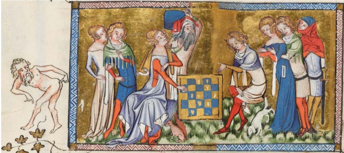
Fesonas and Cassiel the Baudrain Playing Chess (with Nude Marginal Commentary). Jacques de Longuyon, Vows of the Peacock ; Belgium, Tournai, ca. 1345-50. Pierpont Morgan Library, MS G.24, f. 25v (detail). From section 1: "Fashion Revolution, 1330-50"