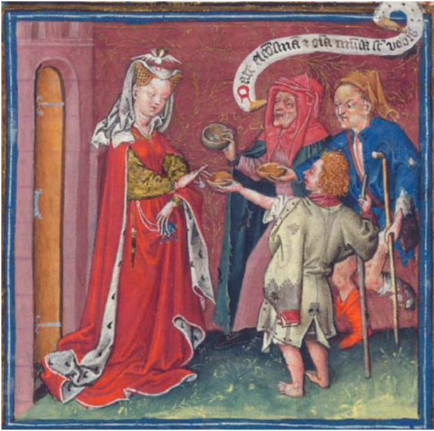
Catherine of Cleves Distributing Alms , by the Master of Catherine of Cleves. Hours of Catherine of Cleves; The Netherlands, Utrecht, ca. 1440. Pierpont Morgan Library, MS M.917, p. 65 (detail). From section 5: “Peacocks of the Mid-Century, 1430-60”