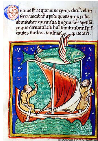
Sawfish and Ship Bestiary, in Latin. England, probably Lincoln, before 1187 MS M.81, fols. 68v-69 Purchased by Pierpont Morgan, 1902

Several key works from the opening rotation will remain on view such as the jeweled Lindau Gospel (ca. 880) from the Abbey of St. Gall and the manuscript of Mozart's famed "Haffner" Symphony No. 35, in its plush presentation box.