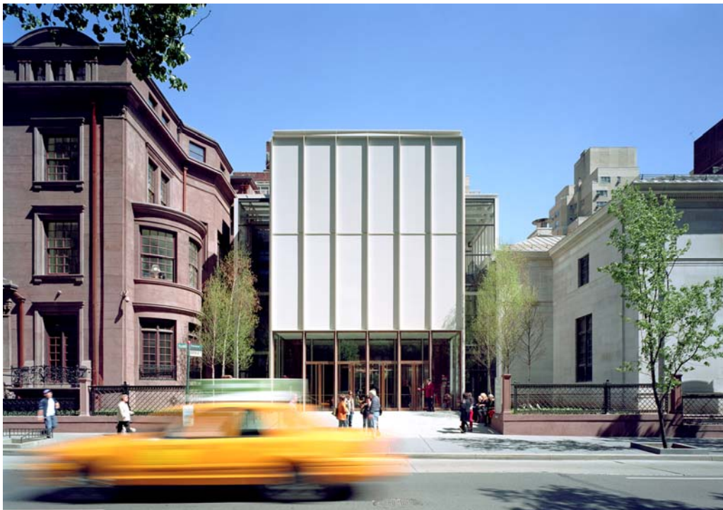
The Morgan Library & Museum, View of the Madison Avenue entrance.