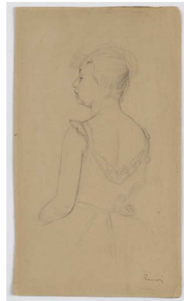
Top: Piero di Cosimo, 1462–1522, Italian, Seated Girl, ca. 1495-1505. The Morgan Library & Museum. Bottom: Pierre Auguste Renoir, 1841–1919, French, Half-length Study of a Woman seen from the Back, her Face in Profile, 1883. The Morgan Library & Museum.

The first important figure study by Renoir to enter the Morgan collection, this exquisite drawing is a preliminary study for one of Renoir’s most well-known paintings, Danse à la Ville , executed in 1883 with its pair, Danse à la Campagne , both now in the Musée d’Orsay. The work exemplifies a change in Renoir’s technique in the early 1880s as he turned to the medium of drawing to add a subtlety, expressiveness, and precision to his art. Renoir attributed this change to having seen the work of Raphael during an 1881 trip to Italy, but the drawing also clearly displays evidence of Renoir’s profound study of Ingres at this time. Indeed, the 1880s have been referred to as Renoir’s “Ingres period.”