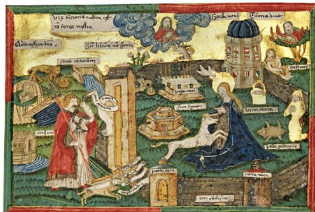
Left: Levitation of Mary Magdalene, miniature from the choir book of King Louis XII and Queen Anne de Bretagne, France, Paris, ca. 1498. The Morgan Library & Museum. Right: The Annunciation as an Allegorical Unicorn Hunt, miniature, Germany, Eichstätt, ca. 1500. The Morgan Library & Museum.