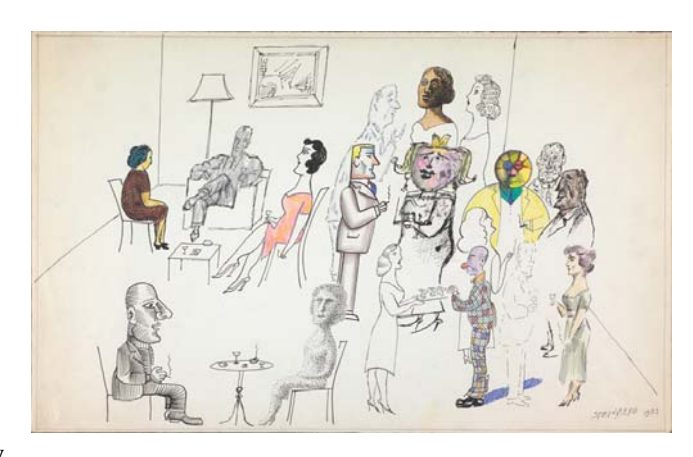
Saul Steinberg, Techniques at a Party, 1953, The Saul Steinberg Foundation, New York, © 2006 The Saul Steinberg Foundation/Artists Rights Society (ARS), New York.

Saul Steinberg (1914–1999), an artist whose magic lit up the pages and covers of The New Yorker for six decades, is the subject of a major retrospective exhibition making its debut at The Morgan Library & Museum from December 1, 2006, through March 4, 2007. Saul Steinberg: Illuminations features more than one hundred drawings, collages, and sculptural assemblages by the artist whom many regard as not only a comic