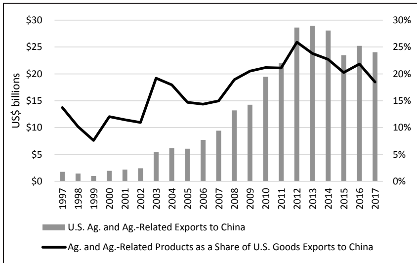
Figure 1: U.S. Agriculture and Agriculture-Related Exports to China, 1997–2017